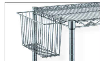
Large Display/Storage Basket