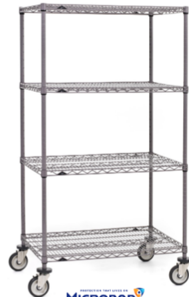
Super Erecta with Metroseal