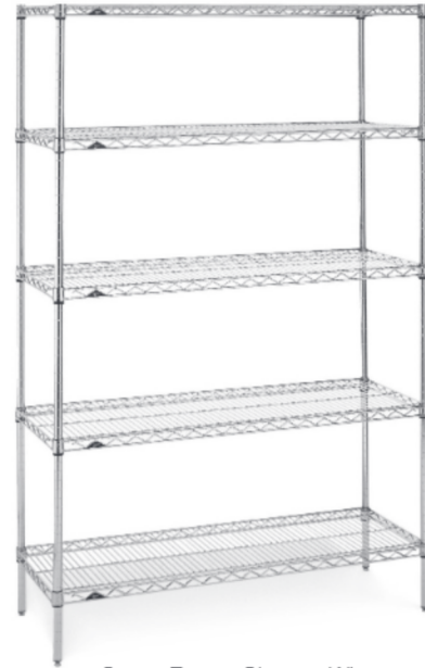
Super Erecta Chrome Wire

Note: Stainless stationary posts are equipped with stainless steel leveling feet.