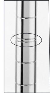
SiteSelect Posts feature double grooves every 8" (203mm) to aid assembly.