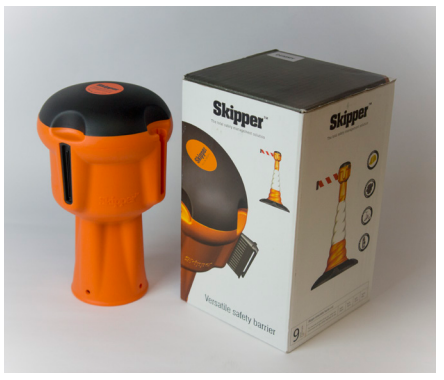
Product and packaging

A. Yes. Dummy units are also available in Orange, Red, Silver, Green and Blue. It's also available in other colours if required. See the customisation page of this document for more information